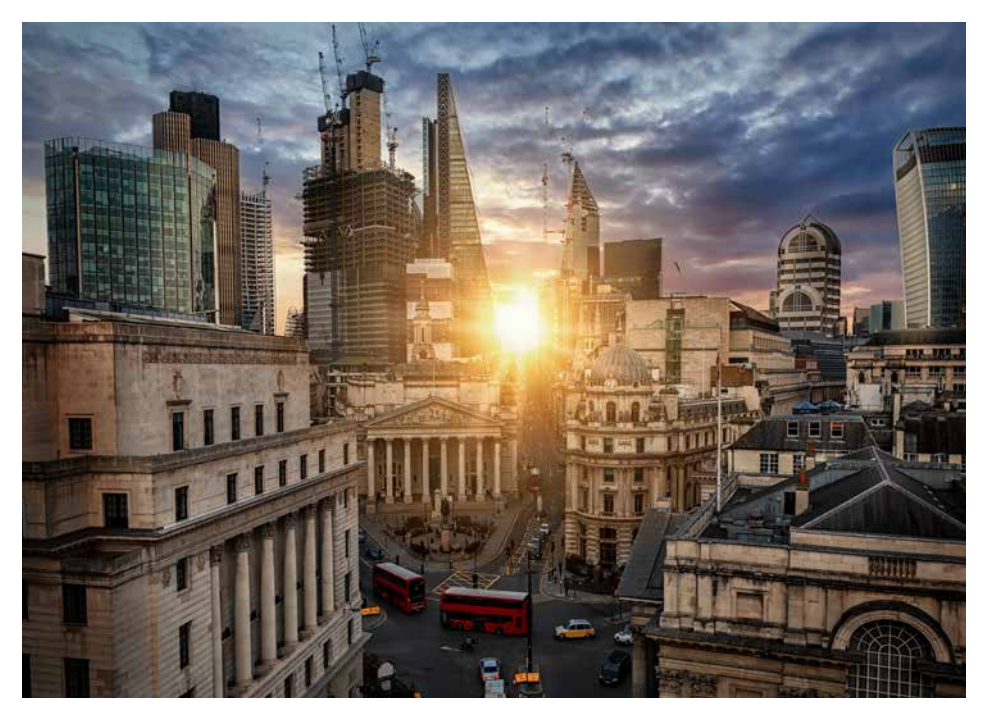
Written March 2020

Financial advice and regular reviews are essential to help position your portfolio in line with your objectives and attitude to risk, and to develop a well-defined investment plan, tailored to your objectives and risk profile.